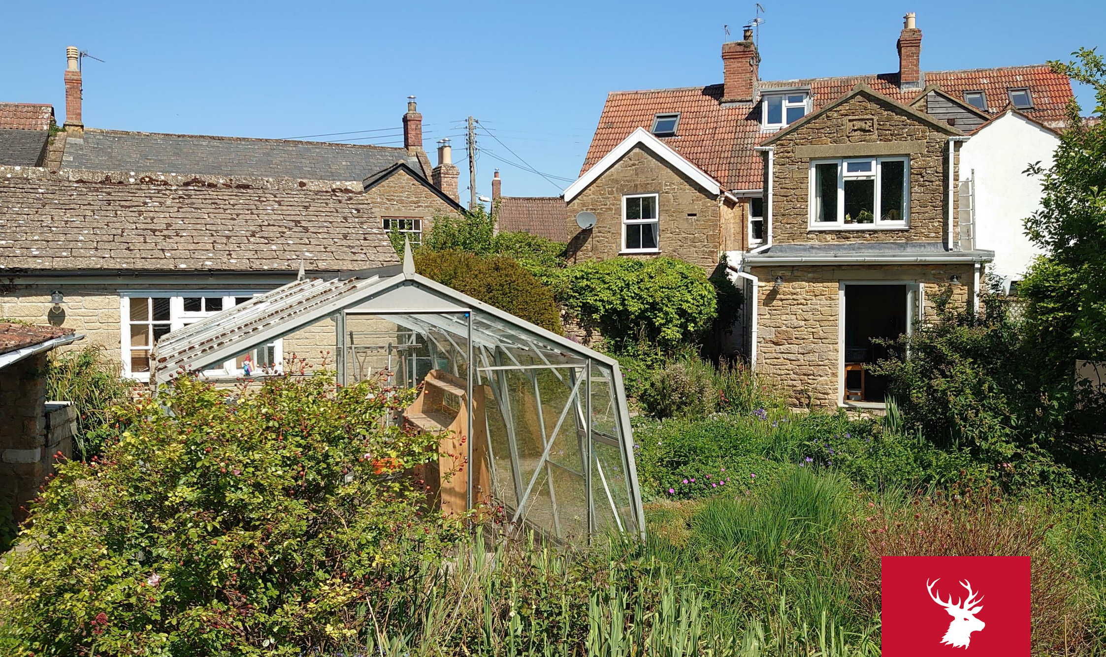
Fernside, 2 Yeovil Road